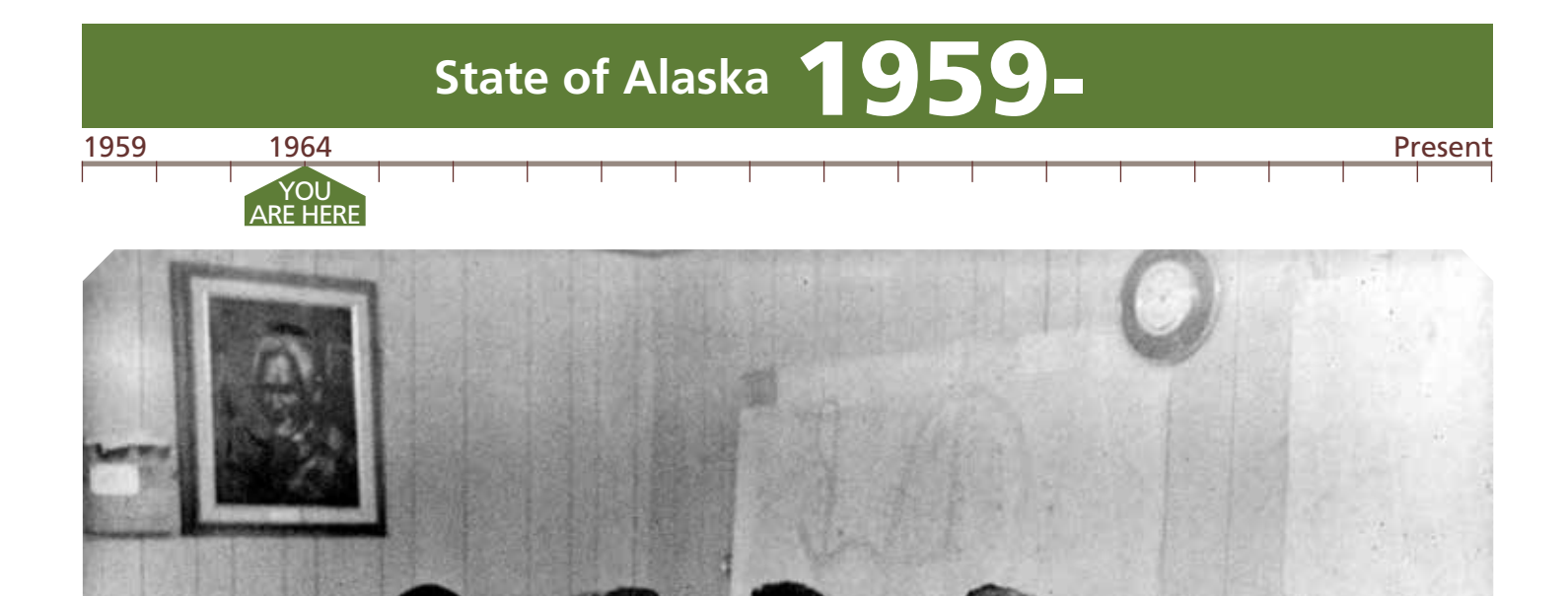
DENA'INA TIME TRAVEL